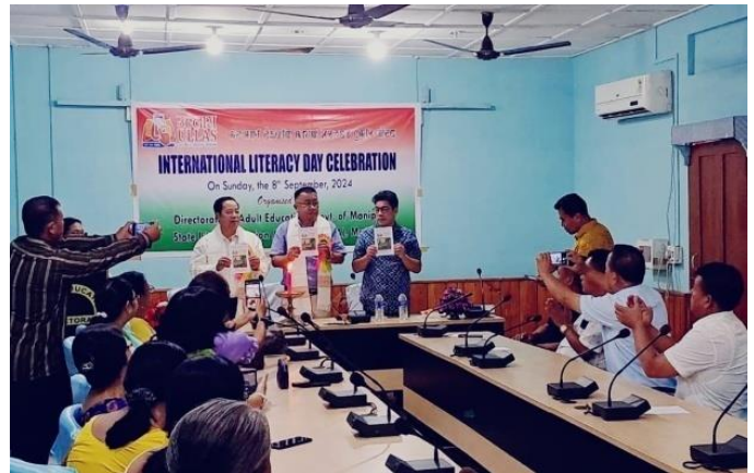
Release of pamphlet