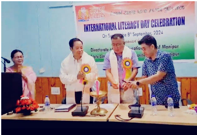
Lighting of Literacy Lamp

The Department of Adult Education, Government of Manipur has been observing this Day (ILD) since its establishment in 1980. On this Day, all stakeholders such as the officials of the Department at the State level and District Level, field functionaries are reminded of the objective of Literacy programmes and their responsibilities.