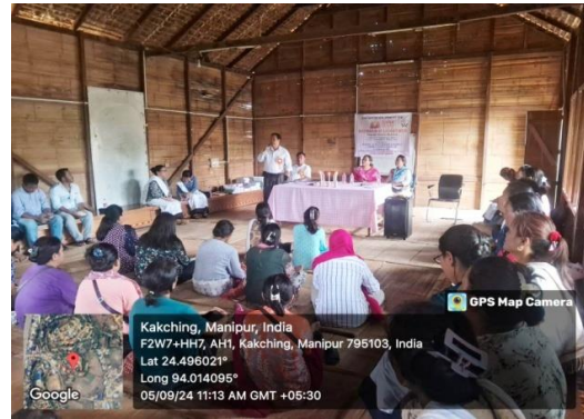
Lighting of Literacy Lamp and Welcome speech